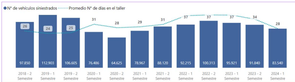
Graph 2: Average days in workshops and number of vehicles with filed claims

Blue: Number of vehicles with claims. Dotted Purple: Average days vehicles spent in workshops.